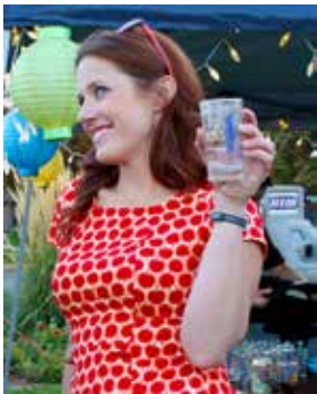
Commemorative Apple Night glass for cider sampling

Hard Cider • Delicious Food • Live Music