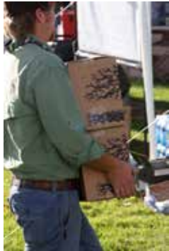
Wide variety of cider to try